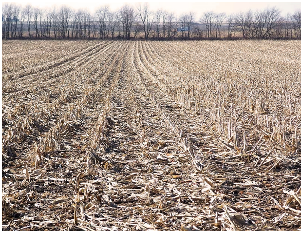
32oz/A Reverb + 5 gal/A UAN28 ◀