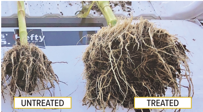
Roots of a non-treated corn plant on the left compared to the roots of a corn plant treated with Heat Shield on the right.

HEAT SHIELD is designed to increase your crop's tolerance to extreme field situations like salt, drought, cold, and heat. The biggest impact will come from Heat Shield when it's included with a seed treatment or applied in-furrow. This is because Heat Shield is a fungal blend that lives and works inside the plant to increase its ability to withstand difficult growing environments.